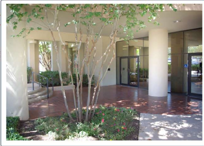
Shaded & Landscaped