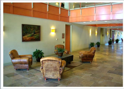
Rustic Texas Style

Austin • Southwest 5508 Hwy 290 West Monterey Oaks